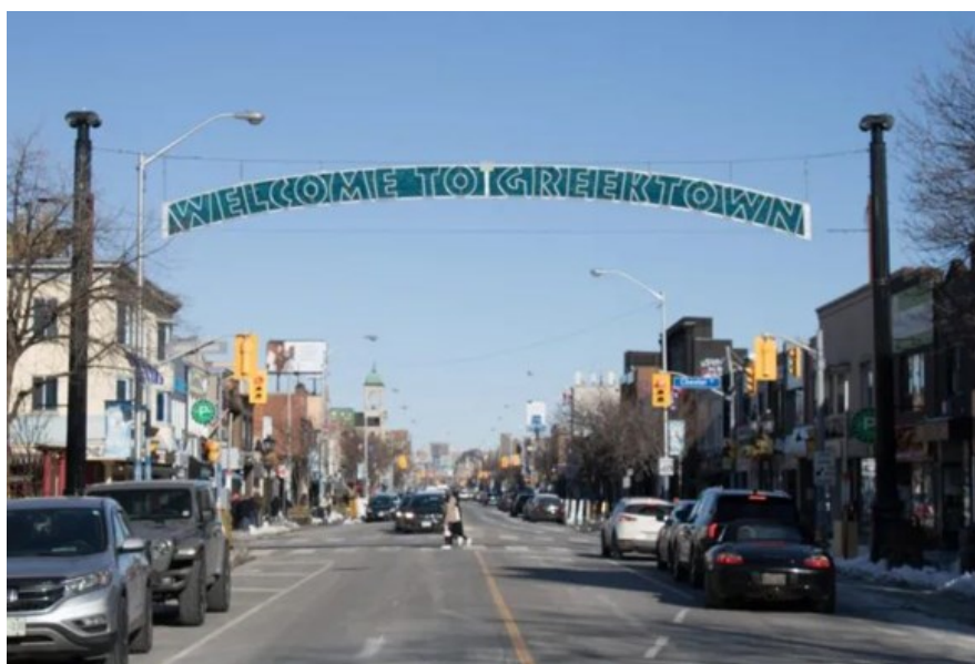
Sign, Greektown, Toronto, Canada