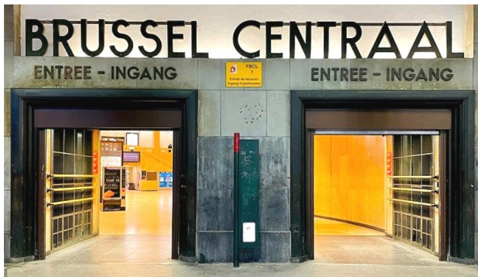
Entrance sign, Central Station, Brussels