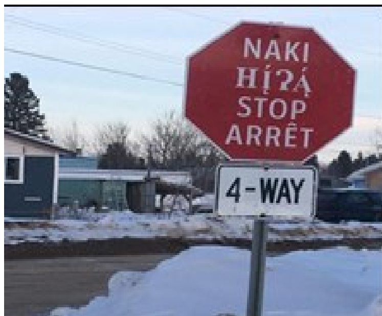
Road Sign, Northwest Territories, Canada.

The visibility and prominence of languages can indicate social hierarchies and power dynamics, reflecting governmental policies. The choice of language on signs often indicates the ethnic, cultural, or regional identity of residents (Pennycook, 2018; Prada, 2024; Van Mensel et al., 2016). For example, in the LL of Belgium, the official languages, French, Flemish, and German, coexist with obvious hierarchical dynamics. In the central train station of the city of Brussels, which has been officially bilingual since 1963 (Blommaert 2011),