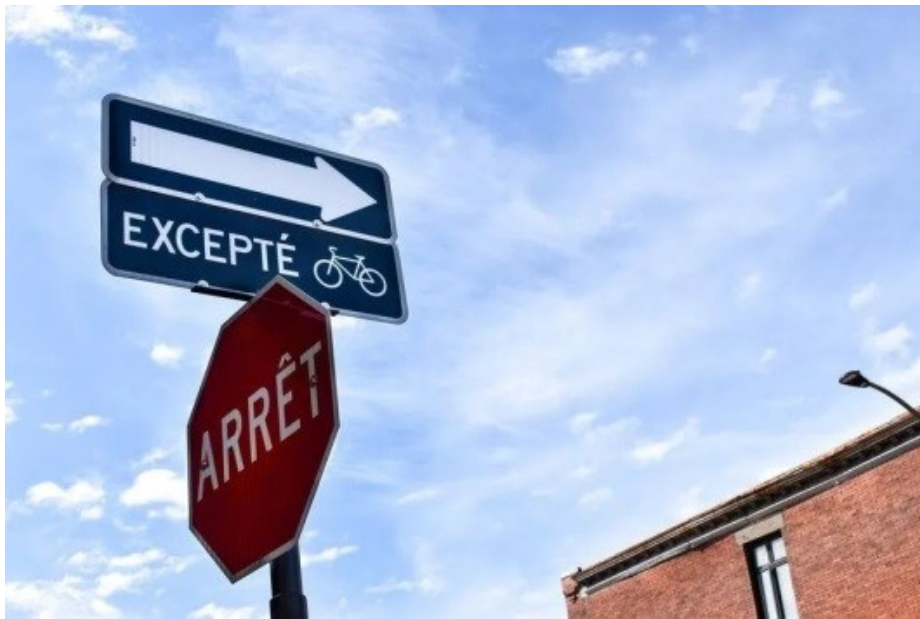
Road Sign, Montreal, Canada.