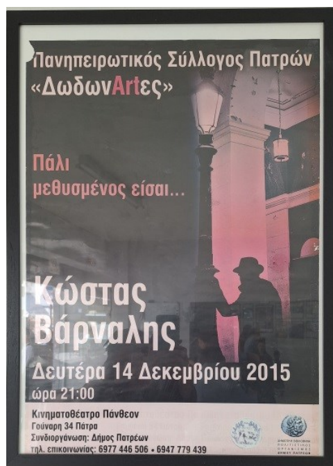
Poster of the Pan-Peiriotic Association of Patras © Evgenia Berdesi

In areas where ethnic or linguistic minorities exist, bilingual signs play an important role in maintaining communities' ethnic identity (Leeman & Modan 2009). However, the presence or absence of such signs may provoke social reactions (Van Mensel et al. 2016). For example, the legally placed road signs in Finiki, Albania were vandalized by Albanian nationalists (Figure 12). Greek names are erased even though the area has been officially recognized by the Albanian state as a minority area. Similarly, the trilingual road sign in Thessaloniki indicating Kemal Ataturk's house has sparked protests in the local community. The sign is written in Greek and English, while the name of Kemal Ataturk is written in Turkish (Figure 13). The use of double inverted commas in place of Greek quotation marks raises questions about the creators' latent meaning and motives (Spolsky, 2024).