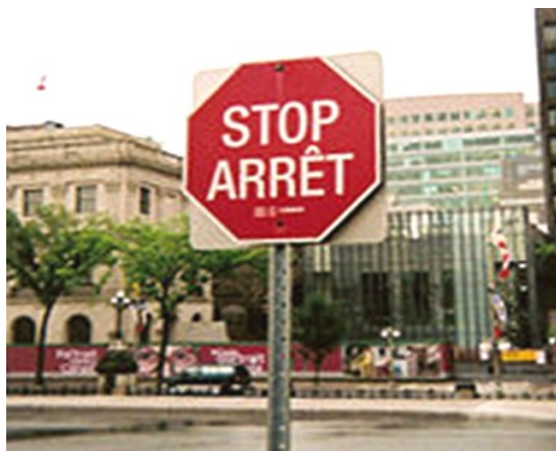
Road Sign, Toronto, Canada