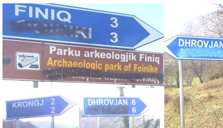
Vandalized road signs, Finiki, Albania.