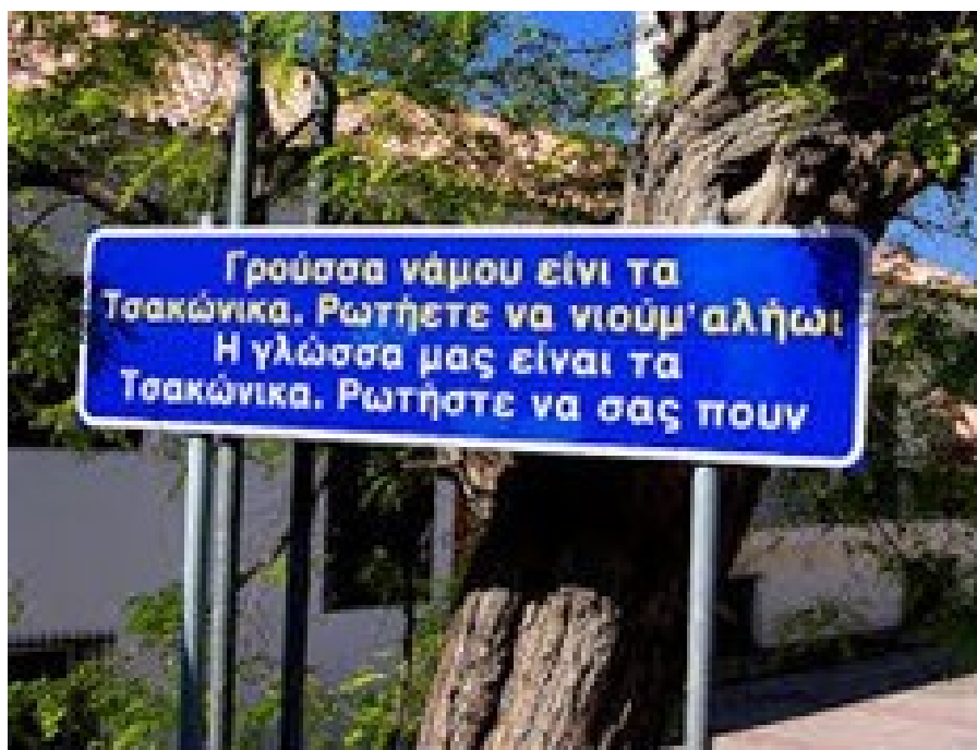
Road Sign in Tsakonian and Modern Greek