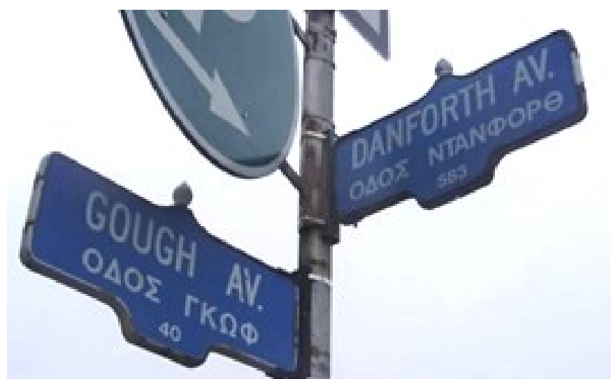
Street names, Greektown, Toronto, Canada