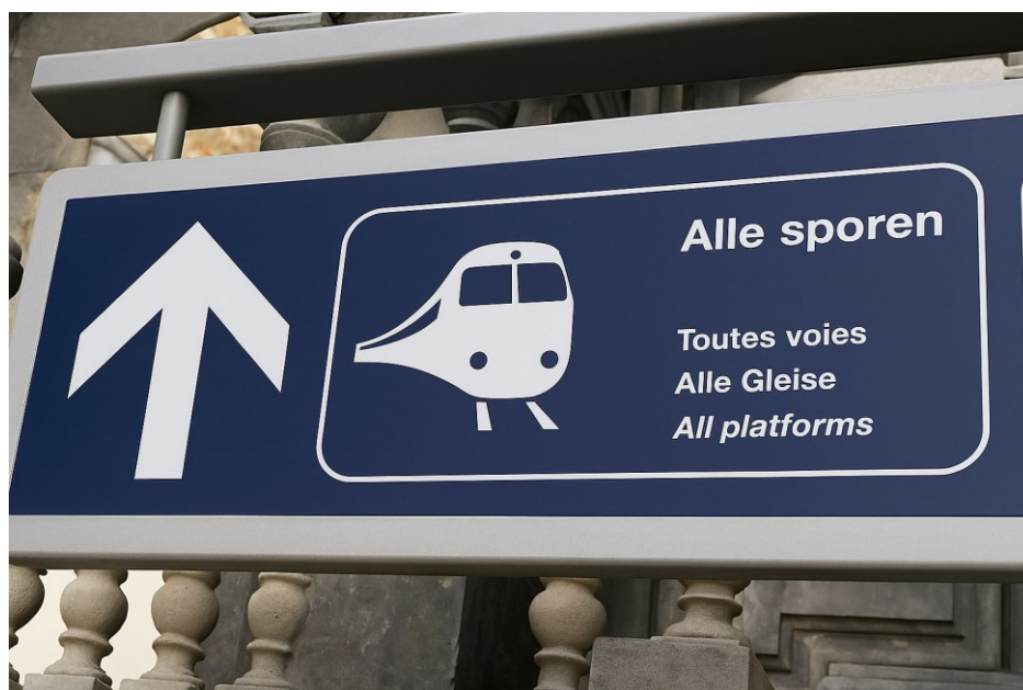
Sign, Central Station, Antwerp

Moreover, the LL reveals how different languages not only coexist but also influence each other and adapt to each other, creating phenomena of translanguaging and linguistic hybridity (Demska, 2019; Matras, 2020; Spilioti & Giaxoglou, 2019). For example, in Figure 9, the English word WiFi is used along with Greek to highlight the need for internet access in a graffiti message, “We wanted Love, now we want Wifi”. In Figure 10, to communicate