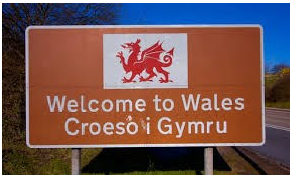
Road Sign in English and Welsh