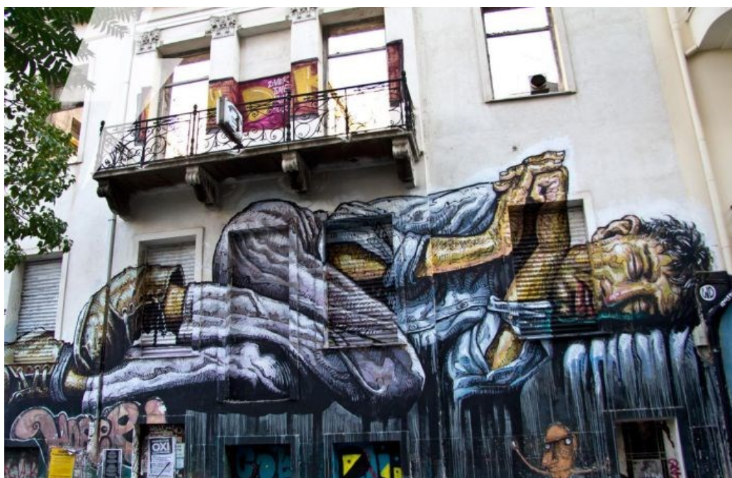
Graffiti, Benaki Street, Exarchia