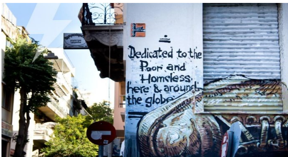
Grffiti, Benaki Street, Exarchia