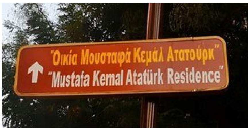
Road sign for the Turkish Consulate, Thessaloniki

In addition to indicating ethnic and cultural identity, LL delves deeper to reveal the individuals' social identity of an area (e.g., Canakis, 2016; Sandsak 2023,) political and gender beliefs and highlight otherness (e.g. Christoulaki 2017). In other words, LL constitutes a creative field where all verbal and semiotic resources contribute dynamically to capture individuals' social identity of an area. For example, in Figures 14 and 15, a graffiti of a homeless man sleeping and the English inscription "Dedicated to the poor and homeless here & around the globe" can be found at Benaki Street, Exarchia. The size of the graffiti and the location indicate part of the social identity of the area. Similarly, the graffiti in Figure 16, placed at the entrance of Perama, Piraeus was inspired both by the work accidents in the Perama Shipbuilding and Repair Zone and the shipwreck of Pylos on May 21, 2023, where more than 80 people from Egypt, Syria, Pakistan, and Palestine died. The graffiti bears the signature of the Youth Communist Party of Greece supporters and depicts a life jacket, a work helmet, and money shaped as coffins. The inscription "CRIME OF PERMANENCE THE SYSTEM KILLS" clearly reflects the traditional center-left political beliefs of the population of the Perama area in Piraeus.