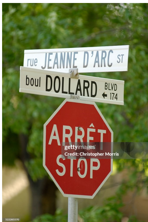
Road Sign, Winnipeg, Canada