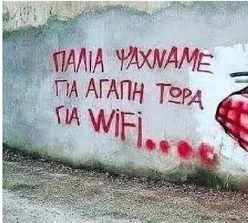
Graffiti with Greek and English words