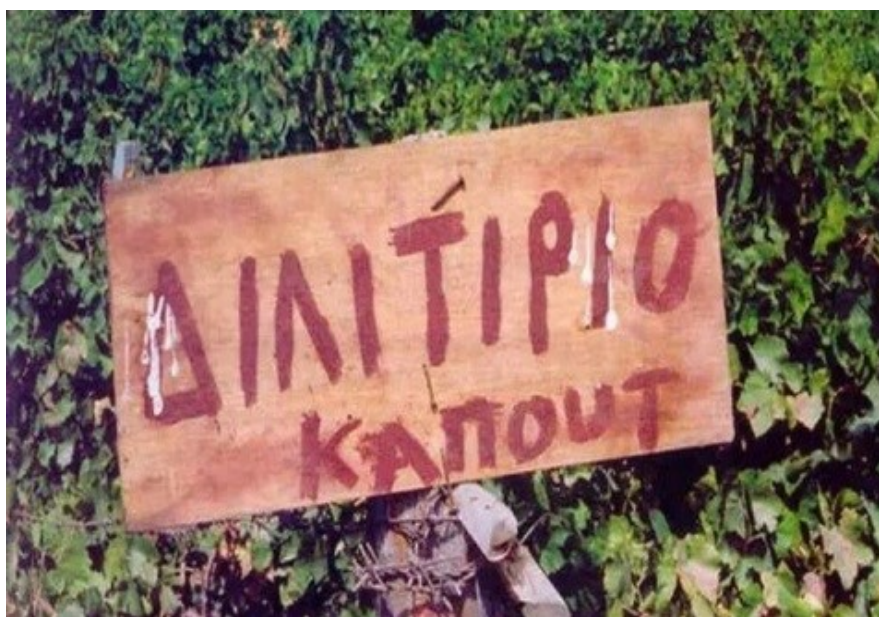
Warning sign.